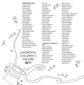
CAST BACK: Prints in black or purple